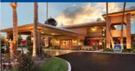
Restful Stay and Value