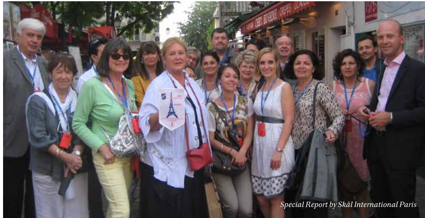
Special Report by Skål International Paris

TOURISM PROFESSIONALS ENJOY THE ATTRACTIONS OF MONTMARTRE