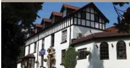
Enhanced Comfort and Service