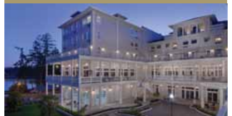
Distinct Style and Plush Amenities